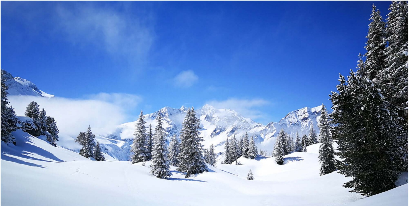
Snowshoeing at Bregenzerwald