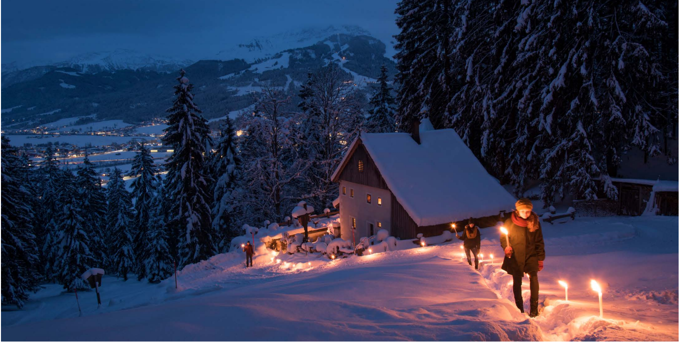
Winter hike to the hermitage region St. Johann in Tirol