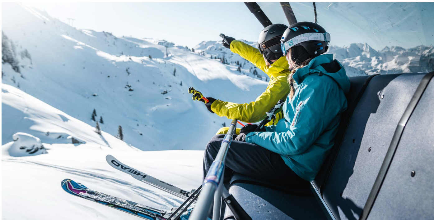
Skiing in the Zillertal Arena