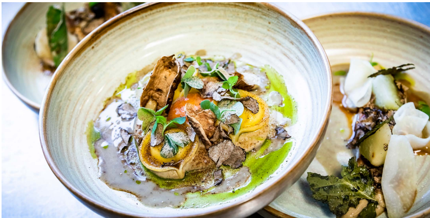
Graz culinary delights in winter