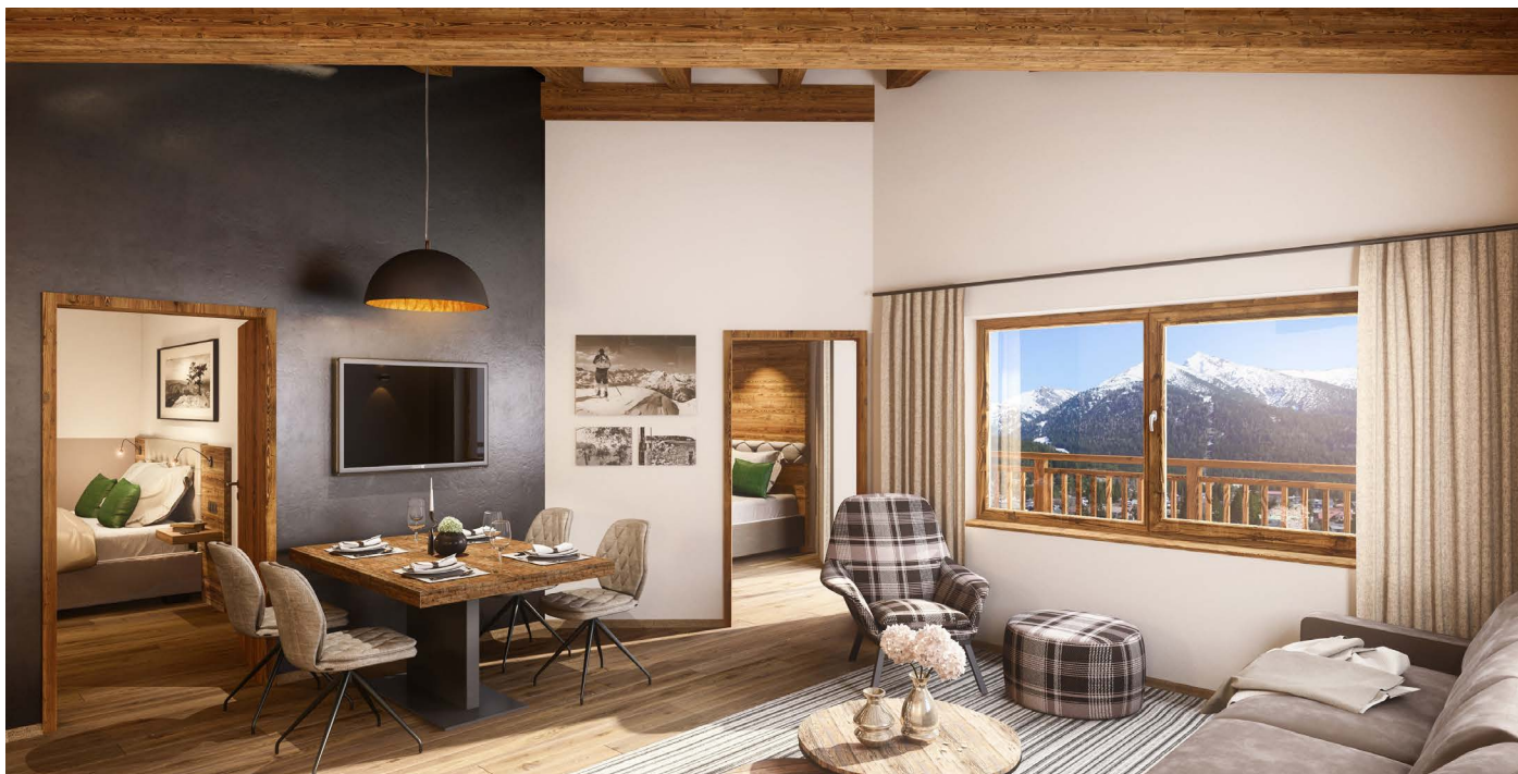
AlpenParks Chalet & Apartment Alpina Seefeld © AlpenParks® Hagan Lodge Altaussee