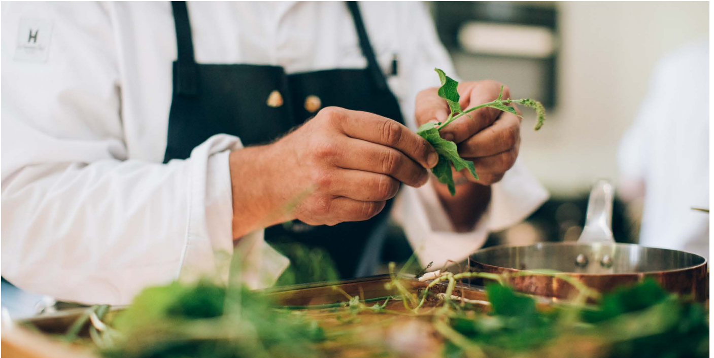
Cooking with herbs