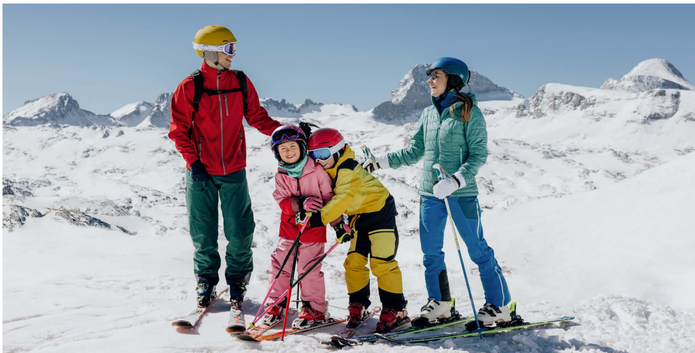
Family skiing at Krippenstein mountain in Obertraun