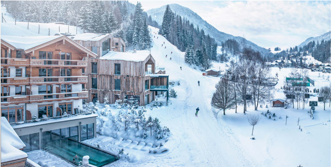
Naturhotel Forsthofgut – Ski-in/Ski-out