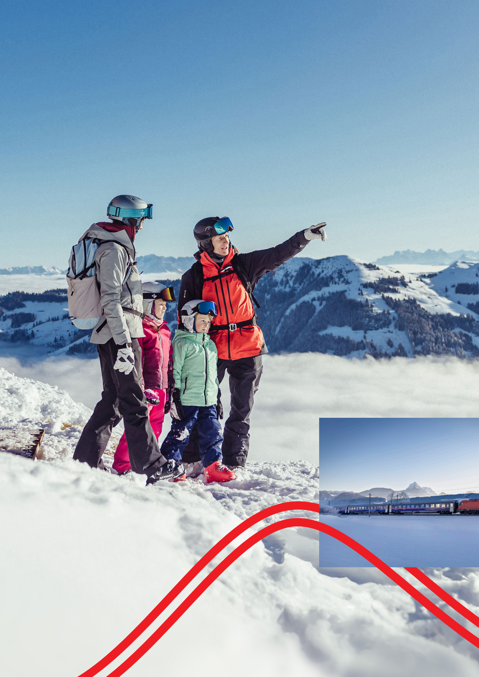
Ski Juwel ski area